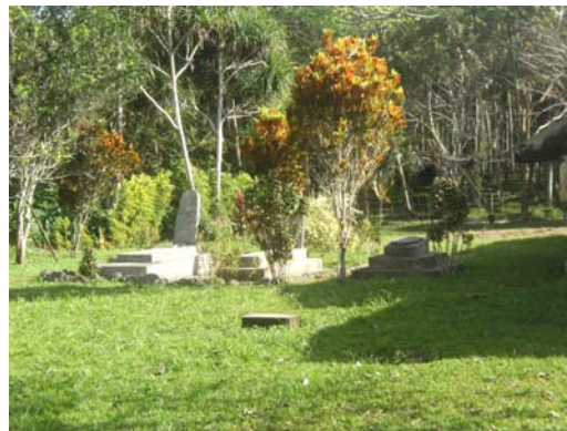
Site of first church house, less than 30m From road