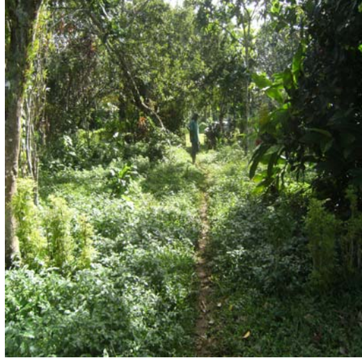
The custom owner of the site and the road can be seen in the background.

There are three stones that are found within this well protected area. This site is also only 7m from the road side.