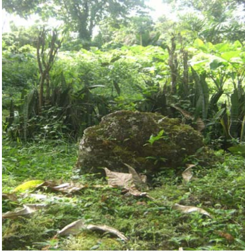
The first stone and boundary in the background.